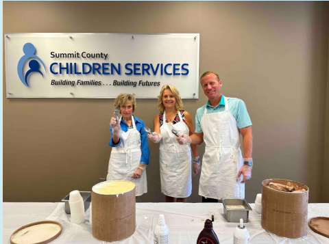
Citizens Advisory Committee Members