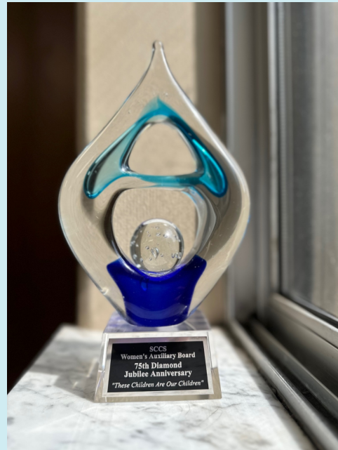
A commemorative award to the WAB from SCCS