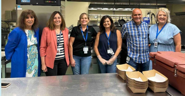
SCCS Executive Team

In July, SCCS held a Summer Fun Day with a hot dog lunch, a sweet treat served by our Citizens Advisory Committee, and stations sponsored by Diversity, ERT, Reward & Recognition, and Wellness Committees!