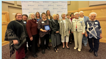
Women's Auxiliary Board Community Volunteer Award Winner