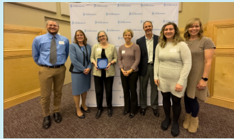
Goodyear Law Department Community Donor Award Winner