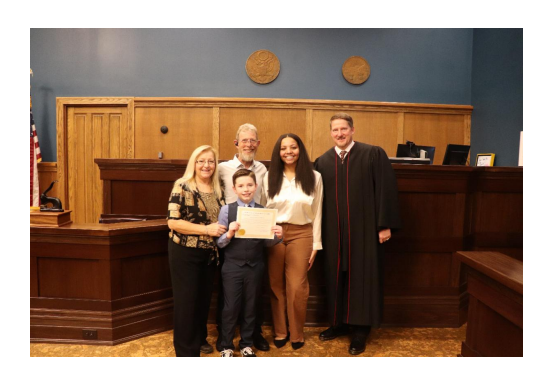
Congratulations to all!